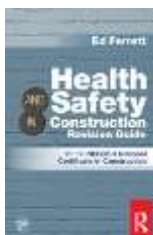
Health and safety in construction revision guide for NEBOSH by Ed Ferrett