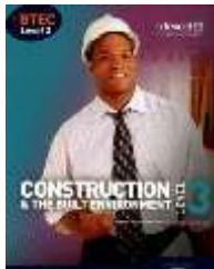
Construction and the built environment BTEC national by Simon Topliss