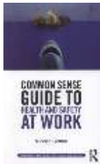
Common sense guide to health and safety at work by Subash Ludhra